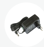
24V 1.2A Adapter