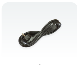
2x power cord